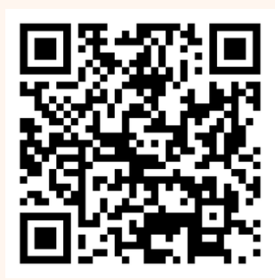
YORK & SCARBOROUGH