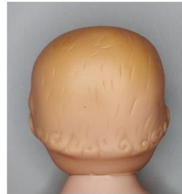
Back of head