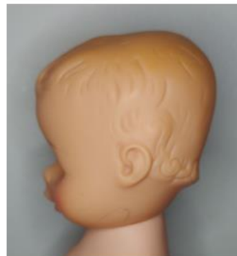
Left side of face and head