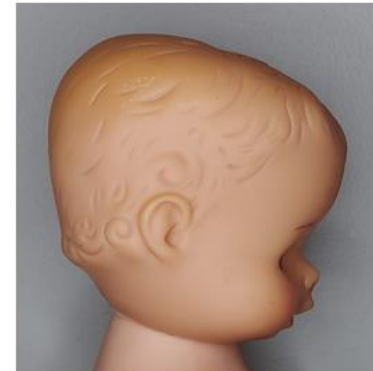
Right side of head